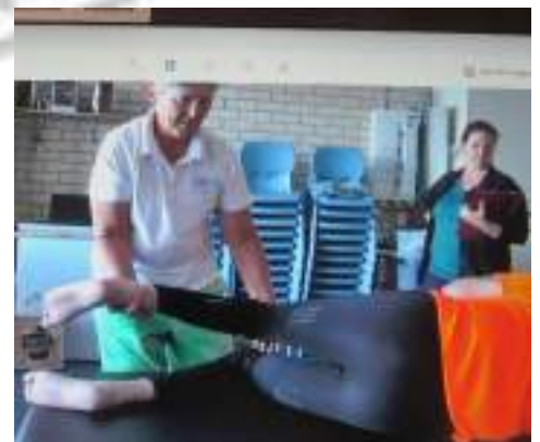
If the paddler cannot extend the leg against gravity, the classifier will turn them to work in The horizontal plane while supporting the limb.