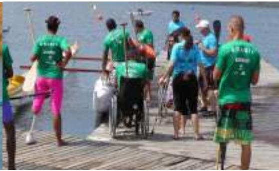
Paddlers with above and below-knee amputations