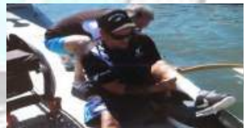
Paddler lacking neuromuscular control of the legs

'This is my life and I absolutely love it. I wouldn't change it for the world. I've done things that other people couldn't dream of.'