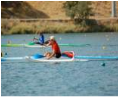
Paddler with one forearm prosthetic