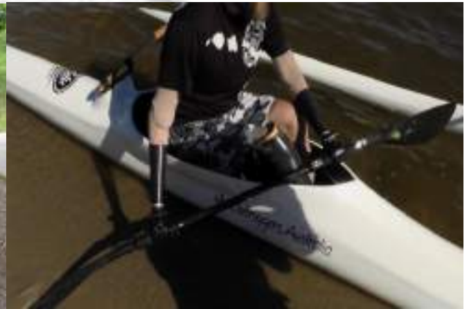
Paddler classified by IVF, missing one lower leg and both forearms. Using prosthetic forearms and hands, this competitor is allowed to use a double-bladed paddle, but has to paddle continuously on one side until switching at normal intervals