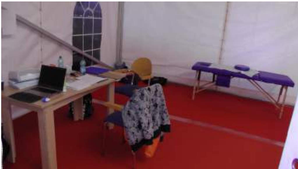
A tented 'lab' showing medical couch with 'wobble cushion' on, used to test trunk muscle control/coordination