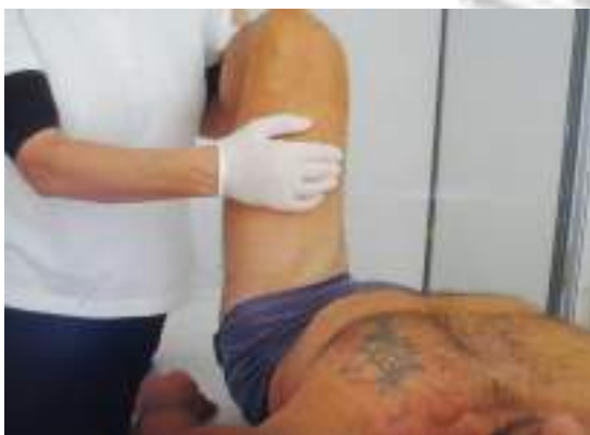
Paddler attempts left hip flexion against gentle resistance

"The greatest pleasure in life is doing what people say you cannot do."