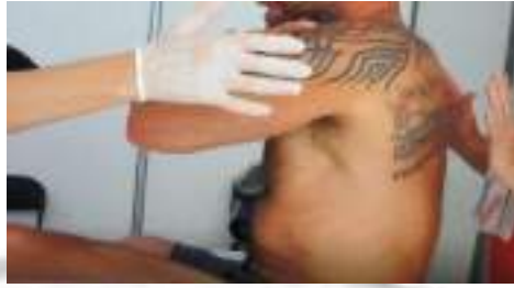
Paddler receiving a sharp push- 'Perturbation Test.'