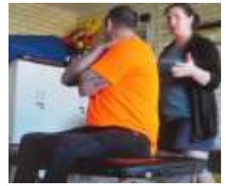
Paddler demonstrates rotation

Trunk function and core stability underpin the normal paddling stroke and their impairment is investigated by the battery of trunk tests, below. These include the paddler being required to lean forwards, to either side, backwards and rotating to their limit while sitting; pushing back in resistance to the tester from various positions; and being jerked in different directions while sitting on a 'wobble-cushion', called the 'perturbation test,' to enable the tester to determine core control. Again, a set of scores will feed into the flow chart.