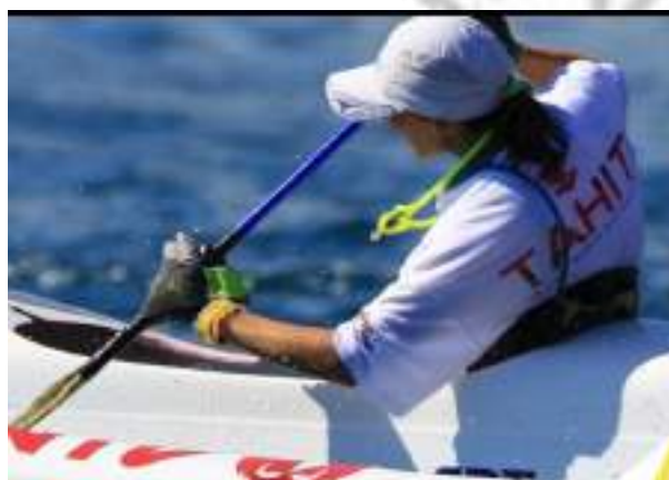
Tetraplegic paddler with hand strapped to paddle Competing in World Distance Championships, V6, Tahiti.