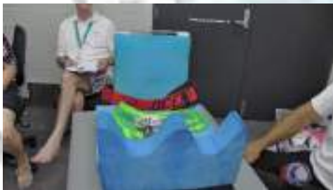
Complex support-seat arrangement supporting trunk and legs

Before being tested, the paddler is required to present the Medical classifier with a set of notes from their clinician providing their clinical diagnosis and medical history. These are used by the Medical classifier to inform trunk and leg function tests. The outcomes of these two lab tests then inform the third battery of paddling tests on the water in the V1 and each score contributes to the route through to their designated race-class.