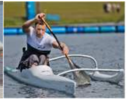
Paddler with high spinal cord lesion using high-backed support seat and torso support strap