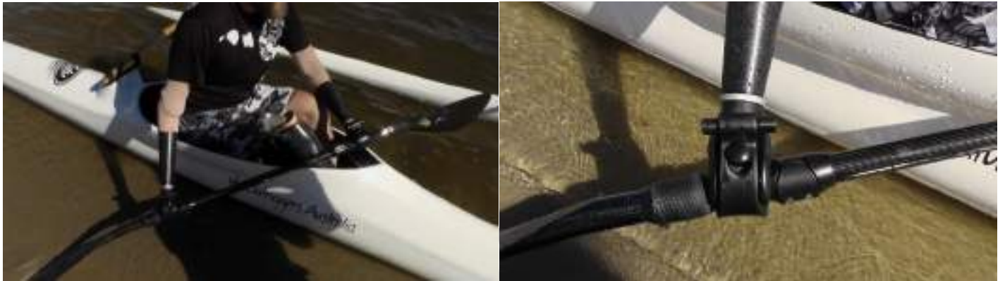
Competitor lacking one lower leg, both forearms and hands using two prosthetics. Illustration shows connection between bespoke prosthetic and paddle. This competitor has been enabled to paddle va'a by the IVF granting use of a double-bladed paddle. He switches on the usual cycle.