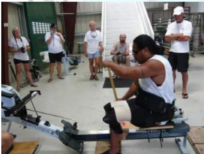
IVF athlete in classification, Sacramento, 2008

Para Va'a competition was initiated by the IVF with a demonstration V12 event at the 2004 Hilo Sprints and V1, V6 and V12 events in 2006 at the Karapiro Sprints. Classification, loosely based on that for rowing, was then started by the IVF Para Committee immediately following Karapiro. It was taken up by the ICF who, following a meeting at the 2012 Paralympic Games that included the IVF Para Chair, commissioned the Swedish School of Health and Sports Sciences (GIH) to research and design an evidence-based classification system, overseen and ratified by International Paralympic Committee sports scientists.